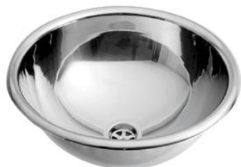
SN0027C / SN0031C / SN0036C Bright finish