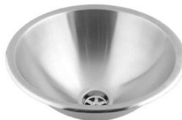
SN0027CS / SN0031CS / SN0036CS Satin finish